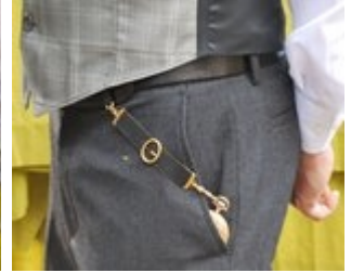
Fabric Ribbon Chain (Slacks)