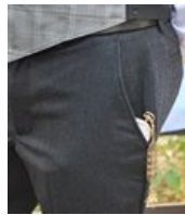
Panel Ribbon Chain (Slacks)