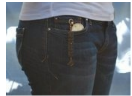
Panel Ribbon Chain (Women's Jeans)