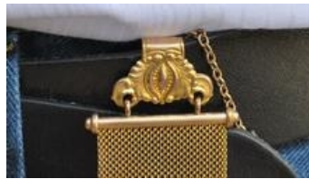
Detail of Belt Clip