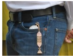
Panel Ribbon Chain (Men's Jeans)