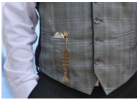
Panel Ribbon Chain (Vest)

Among the various types of ribbon watch chains, the panel style has become the most popular women's option (see right photo), as they are available in smaller dimensions and often are not designed to attach to any articles of clothing.