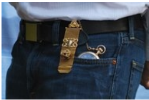
Mesh Ribbon Chain