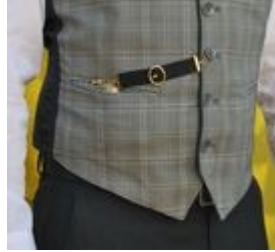
Fabric Ribbon Chain (Vest, Pocketed)