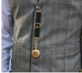
Fabric Ribbon Chain (Vest, Hanging)

Today, you will see many more styles created from metallic mesh or metal panels, as noted below. These photos demonstrate three different ways to wear a ribbon chain that is intended to attach to the wearer's garment.