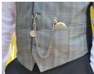
Albert Chain w/ Spring Ring (Vest)

Smaller rings, typically found on lighter weight chains, can be attached around the thread behind a button. This method of attachment emulates a t-bar style of display with the additional security found with the spring ring clasp