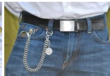
Albert Chain w/ Spring Ring (Pants)