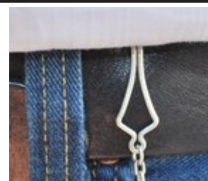
Detail of a Belt Clip

Belt clips are also used to attach pocket watch chains. The left photo here shows a "pressure-fit" clip that was introduced in the middle of the 20th century, and will hang the chain similar to the lobster claw finding shown in the right photo.